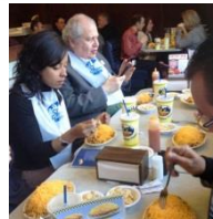
Visiting group from Brazil tasting Skyline