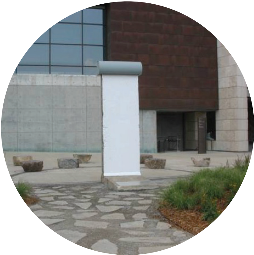
Berlin Wall Memorial, National Underground Museum Freedom Center, Cincinnati